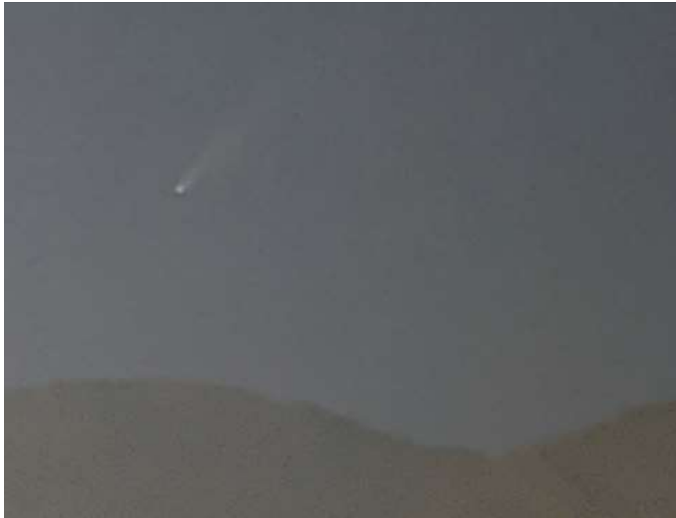
Comet Neowise C/2020 F3 seen from Southern California on July 17, 2020